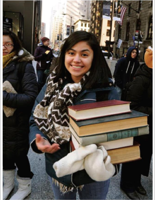
At an Immigrant Youth Justice League rally in Chicago in 2010. Contact an organization near you and get involved!

If you are awarded a scholarship but the award money is not enough to cover your costs, be aware that some scholarships have an appeal process in which you may receive additional aid under special circumstances.