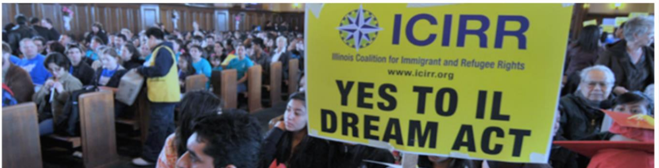
At a Chicago New Americans Rally on April 30, 2011 in support of the Illinois DREAM Act.

www.collegeillinois.org ISAC.529info@isac.illinois.gov 529 Prepaid Tuition Program PO Box 19291 Springfield, IL 62794