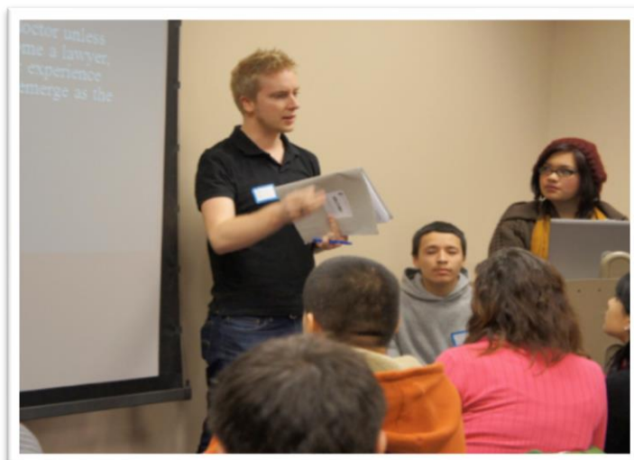
Immigrant Youth College Fair in Cicero in 2010 hosted by the Immigrant Youth Justice League and Nuestra Voz.

8 Consider your finances. Speak with your parents to understand what your financial situation is with respect to paying for college. If need be, research what scholarships, financial aid packages, and private loans are available to you. More information about how to finance your education is included in the next chapter.