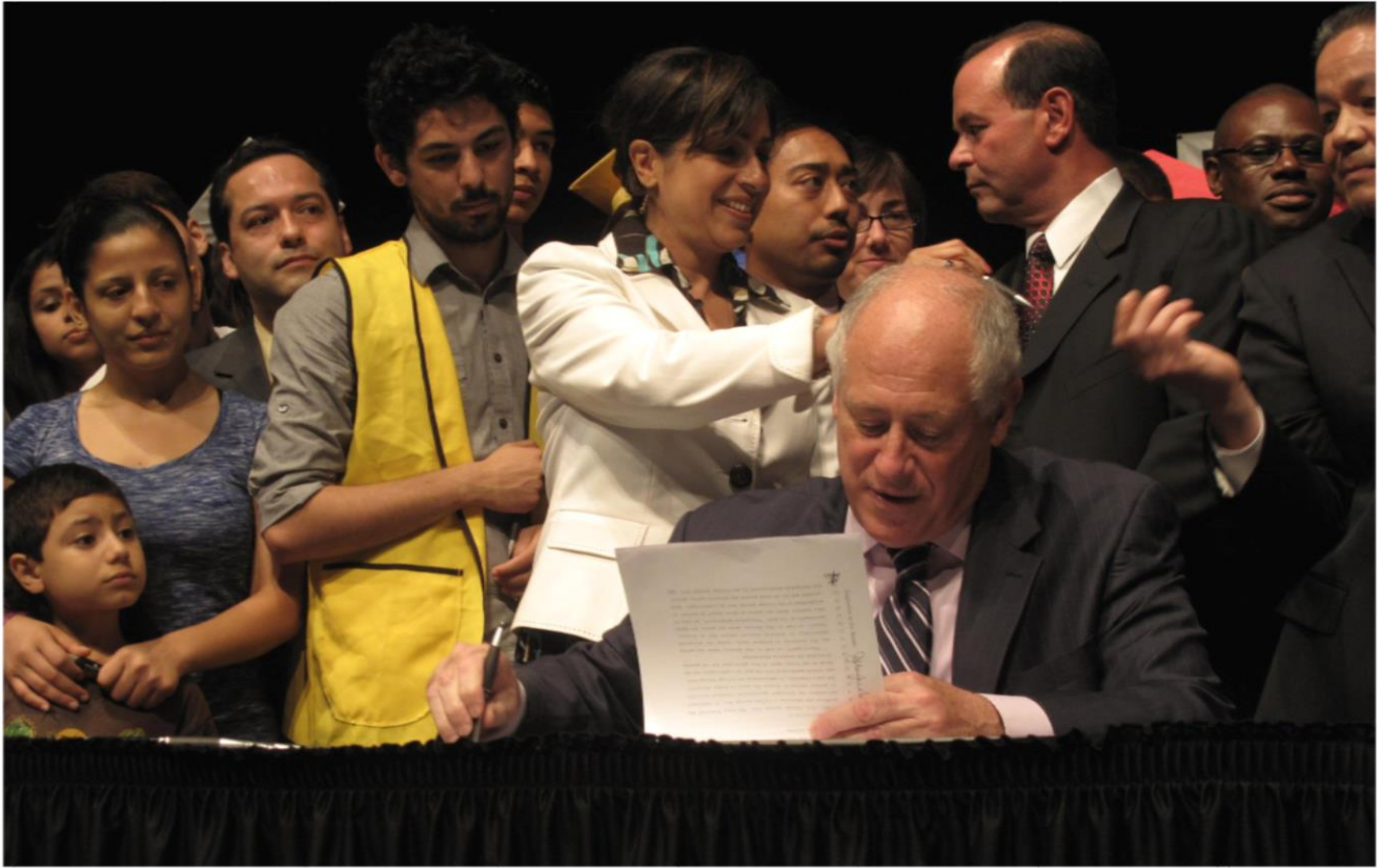
Governor Pat Quinn signs the Illinois DREAM Act into law on August 1, 2011, at Chicago's Benito Juarez High School.