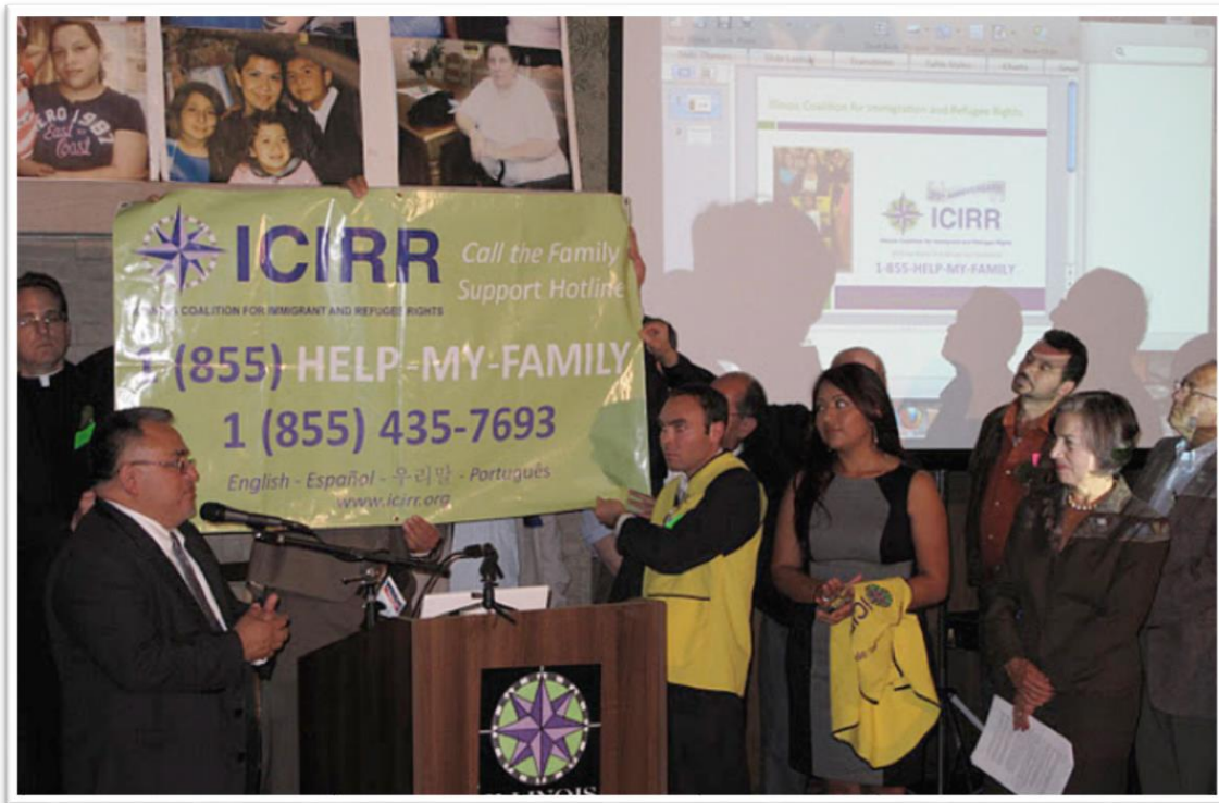
Celebrating the launch of ICIRR's volunteer run Family Support Hotline.

Contact a community organization near you if you run into any difficulties regarding your immigration status as you navigate higher education in the United States, such as